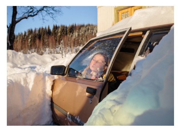
Dawin Meckel, Pindar Street, 2017, from the series "Die Wand (The Wall)", 2017–2018 Espen Eichhöfer, Bil, 2020, from the series "Papa, Gerd und der Nordmann", 2017–2020 From the exhibition CONTINENT – In Search of Europe, Akademie der Künste

The 9th edition of EMOP Berlin — European Month of Photography will take place from 1—31 October 2020. More than 100 Berlin museums, galleries, cultural institutions, embassies, alternative art spaces, project spaces, and photography schools will offer a wide range of exhibitions and events showcasing the beloved and celebrated medium in all its diversity. This year's main theme is Europe — Identity, Crisis, Future. Further topics such as 30 years of German reunification and 100 years of Greater Berlin, as well as classical genres such as portrait, architectural, and fashion photography will also be represented.