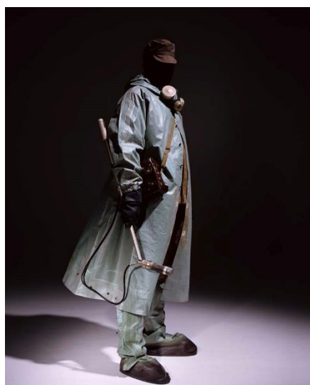
Andreas Mühe, Biorobot II , 2020, © VG Bild-Kunst Bonn, Courtesy St. Matthäus Kirche

Opening 1 October 2020, 12 noon to midnight EMOP Opening Days 1 – 4 October 2020 Akademie der Künste, Pariser Platz 4