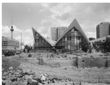
Thomas Platow, Gaststätte „Ahornblatt“ auf der Fischerinsel, Gertraudenstraße (Mitte), 8. August 2000, © Landesarchiv Berlin, Thomas Platow / Courtesy: Landesarchiv Berlin