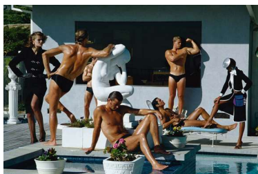
Helmut Newton, Stern, Los Angeles, 1980, © Helmut Newton Estate / Courtesy: Helmut Newton Foundation