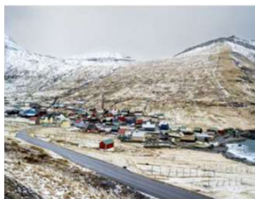
janKB, o.T., a.d.S. Ein Mann, die Insel und eine Fliege im Raum, 2018, © janKB / Courtesy: Fotopioniere Louis@Nicéphore