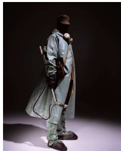
Andreas Mühe, Biorobot II, 2020, © VG Bild-Kunst, Bonn, Courtesy: St. Matthäus-Kirche