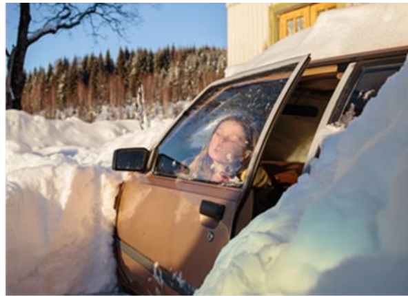
Dawin Meckel, Pindar Street , 2017, from the series Die Wand , 2017–2018; Espen Eichhöfer, Bil , 2020, from the series Papa, Gerd und der Nordmann , 2017–2020; Exhibition: CONTINENT – In Search of Europe, Akademie der Künste

The 9th edition of EMOP Berlin — European Month of Photography will take place from 1–31 October 2020. More than 100 Berlin museums, galleries, cultural institutions, embassies, alternative art spaces, project spaces, and photography schools will offer a wide range of exhibitions and events showcasing the beloved and celebrated medium in all its diversity. This year's main theme is Europe — Identity, Crisis, Future . Further topics such as 30 years of German reunification and 100 years of Greater Berlin , as well as classical genres such as portrait, architectural, and fashion photography will also be represented.