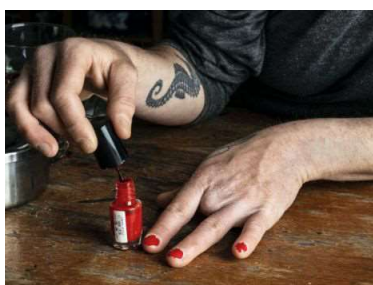
Carina Linge, Identität, 2019, © Carina Linge / Courtesy: Jarmuschek + Partner