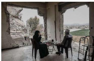
Sameer Al-Doumy, Another Face of War, Syria, a.d.S. Another Face of War, Syria, 2019, © Sameer Al-Doumy / Courtesy: CLB Berlin