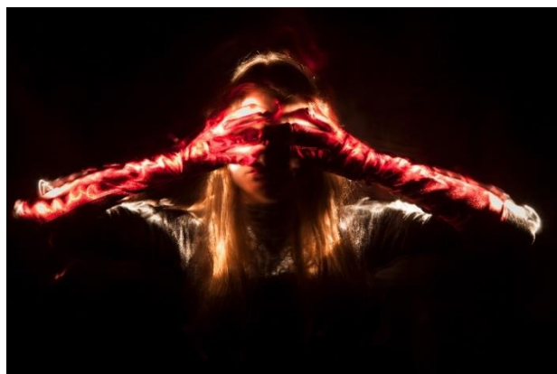
Susanne Emmermann, Untitled, 2017 © Susanne Emmermann

Opening 1 October 2020, 12 noon to midnight EMOP Opening Days 1 – 4 October 2020 Akademie der Künste, Pariser Platz 4