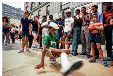
Martha Cooper, B-Boys breaking on cardboard, Upper Westside, NYC, 1982, © Martha Cooper, Courtesy: URBAN NATION — Museum for urban contemporary art