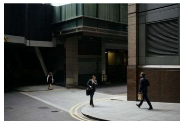
Dawin Meckel, Pindar Street, a.d.S. Die Wand, 2017—2018, © Dawin Meckel/OSTKREUZ / Courtesy: Akademie der Künste, Berlin