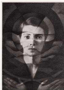
Yva, Selbstporträt, 1926, © DAS VERBORGENE MUSEUM / Courtesy: DAS VERBORGENE MUSEUM