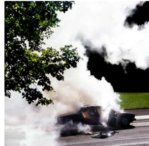
Sascha Weidner, Implode II, 2010, © Sascha Weidner Estate, Courtesy: Dorothee Nilsson Gallery