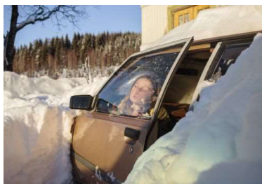
Espen Eichhöfer, Bil, a.d.S. Papa, Gerd und der Nordmann, 2017—2020, © Espen Eichhöfer/OSTKREUZ / Courtesy: Akademie der Künste, Berlin