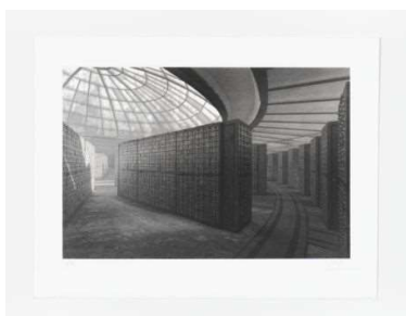
Fiona Tan, Shadow Archive IV, 2019, © Fiona Tan / Courtesy: BORCH Gallery & Editions, Copenhagen/Berlin