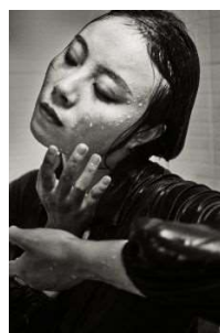
Klaus Mellenthin, Ein Scheffel Perlen, 2019, © Klaus Mellenthin | BFF Professional / Courtesy: BFF — Berufsverband freier Fotografen und Filmgestalter e. V.