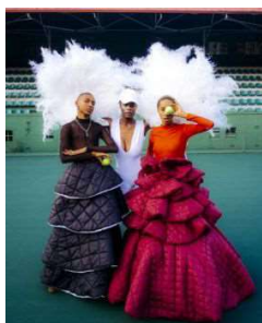
Birk Alisch, Gamechangers, 2020, © Birk Alisch, 2020 / Courtesy: Lette Verein Berlin