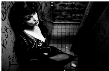
Miron Zownir, Berlin, 1980, © Miron Zownir, Courtesy: Museum für Fotografie — Sammlung Fotografie der Kunstbibliothek SMB