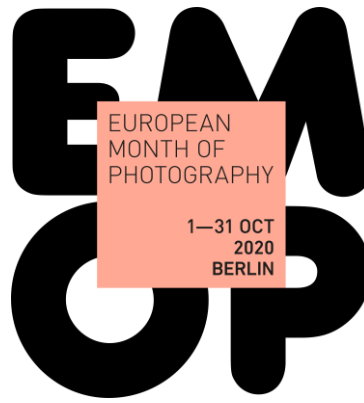
Photo Book Talk

Photo books offer much more than a “best of” compilation of images: they are works of art in their own right. Three Berlin publishers that focus on photography and the photographers they work with present their collaborative publications.